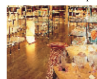
A variety of glass products