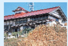
Otaru City Nishin Goten

12 Otaru City Nishin Goten (built 1897) Built during the most prosperous period in the history of Otaru's fishing industry, this large-scale dormitory provided accommodation for herring fishermen at the time. The interior houses equipment used in their work and day-to-day lives, as well as photographs and important data from the era. Designated as a tangible cultural property of Hokkaido. Location: Shukutsu 3-228. Tel. (0134) 22-1038. Early Apr. ~ late Nov. 9:00 am - 5:00 pm every day. Adults: ¥300. High school students: ¥150. #10 or #11 Chuo Bus from JR Otaru Sta.